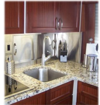
Stainless steel and granite galley with Sapele cabinetry