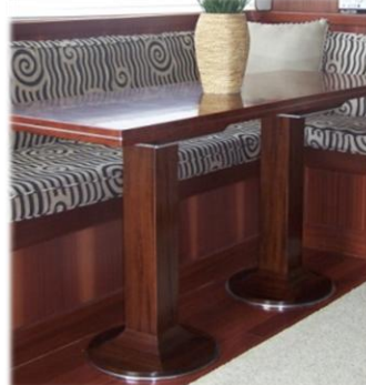
Custom designed and built Bubinga dining table with stainless steel inlays and surfaces