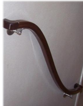
Custom serpentine handrail with stainless steel inlay